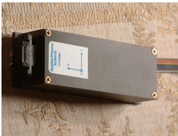
Figure 1: MADS fluxgate sensor

MADS has been specifically designed to detect EIFs (see Anomaly 34 , p22). It consists of two fluxgate magnetic sensors (fig. 1) which can measure fields down to 0.5nT over the low frequency range 0 - 125 Hz. The sensors are triaxial, allowing the overall field to be summed