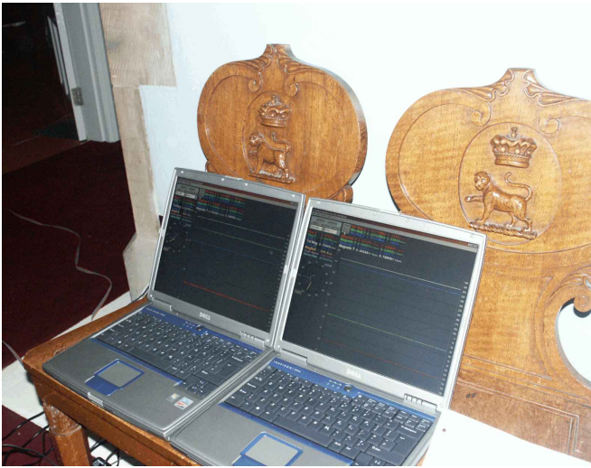
Figure 3 MADS in use at Muncaster

of MADS, often neglected in previous studies designed to test environmental variables at haunted locations.